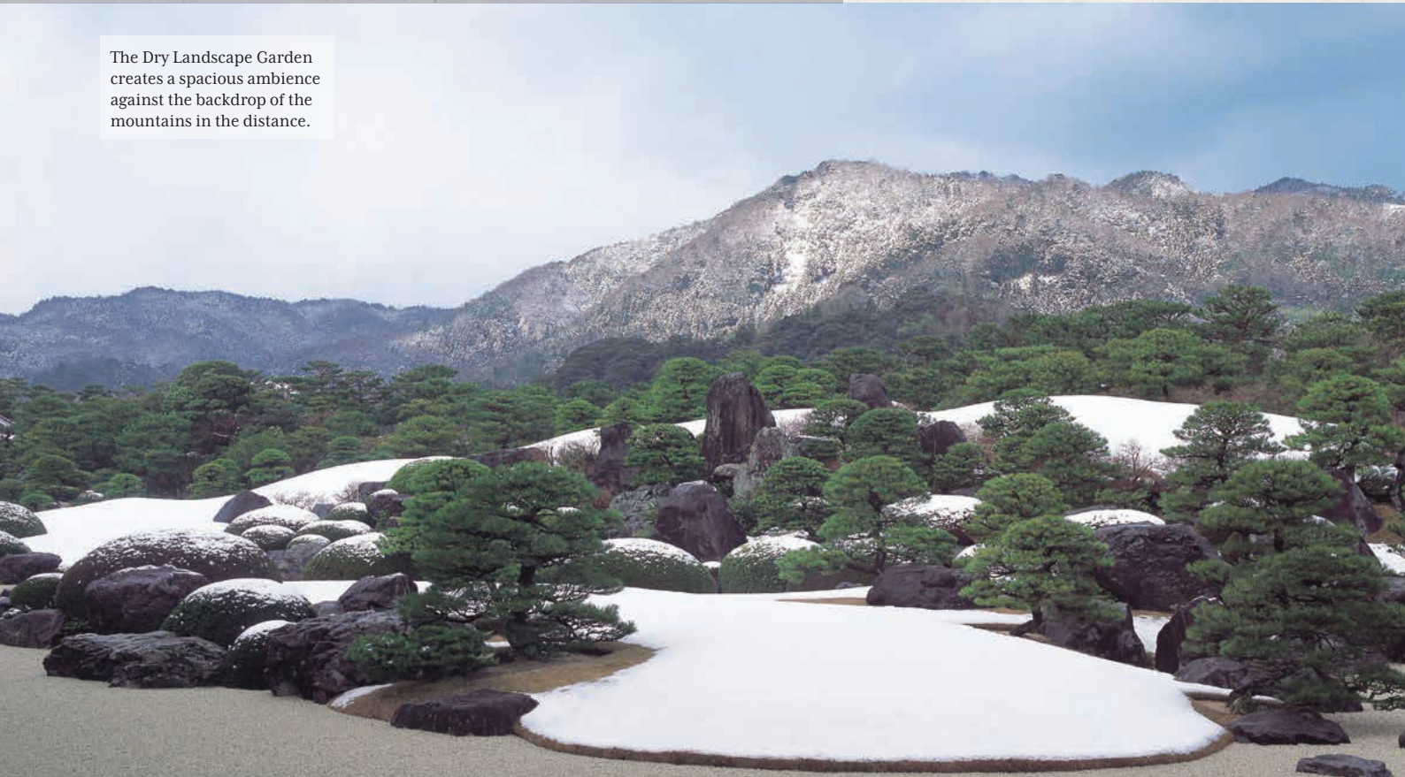
The Dry Landscape Garden creates a spacious ambience against the backdrop of the mountains in the distance.